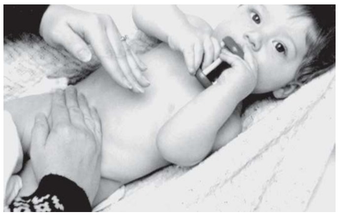
Using the side of your hand, make downward strokes on baby's tummy from rib cage to pelvis. This is a paddling motion of one hand following the other, like a water wheel.