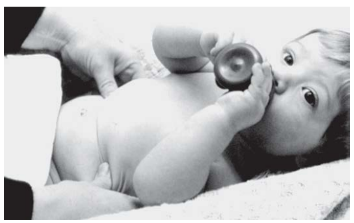
Fulling Massage method 2

With thumbs together and flat on baby's tummy, use a push-pull motion out to the sides. Be sure to use a flat thumb and do not poke into the tummy. The "fulling" sequence should be done in this order: